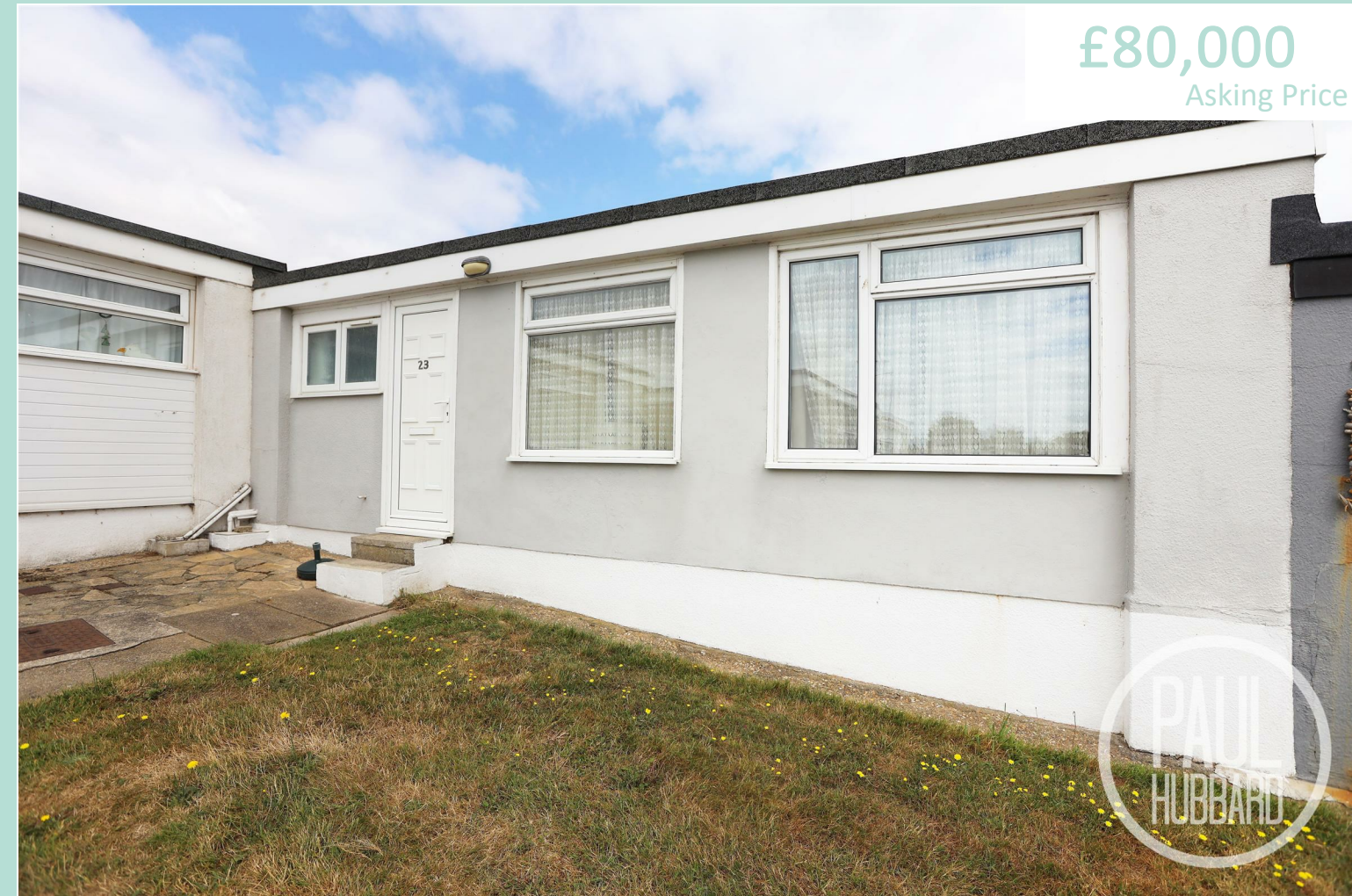
SEAVIEW CHALET 501 sq.ft. (46.6 sq.m.) approx.